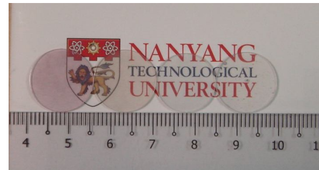
From left to right: 5at.%Er:YAG, 5at.%Ho:YAG, 5at.%Tm:YAG, Pure YAG